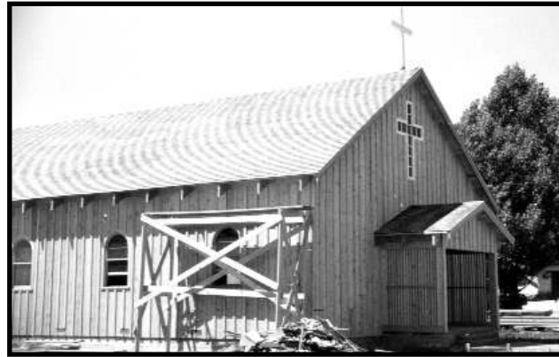
Construction nears completion of the Christ the King Church in Chester in 1955.