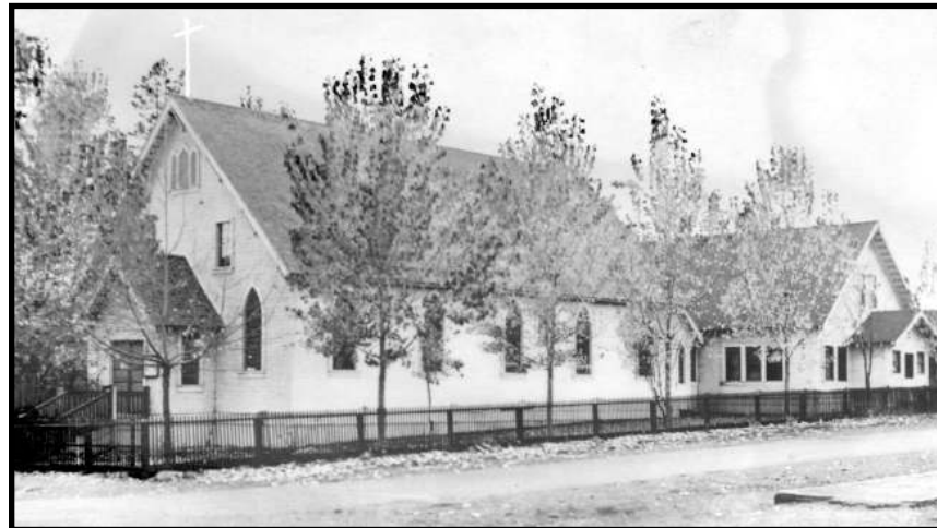
An archival photo of Our Lady of the Snows Church captures the early days.