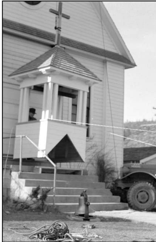
As the bell tower is lifted into place on to the roof of St. John's Church, Quincy in 1952, the bell rests on the grass below the church steps, center.

The historic bell was a gift to St. John's from the Western Pacific Railroad on June 5, 1952. In the same year, St. John's erected a bell tower on top of their church, which was originally constructed in 1938. The bell was replaced in the late 1950s by another donated bell and, since then, has remained unused in storage until the groundbreaking of our new church on Sept. 20, 2009.