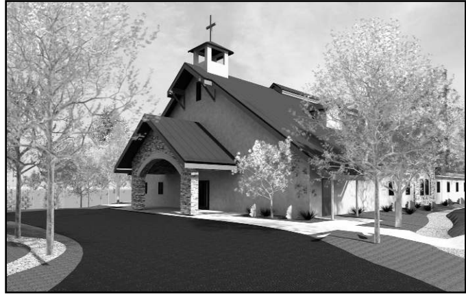
Computer-generated rendering of our new church to be completed Spring 2010. Comstock Johnson of Mather, Calif. are the architects and Hilbers, Inc. of Yuba City, Calif. is the general contractor.

Thanks be to God! After many years of discussion, fund raising and a lot of hard work of dedicated parishioners, we have arrived at the groundbreaking liturgy for our new church at Lake Almanor. It will serve as a foundation for us to bring both unity and renewed life to the Catholic community of the Lake Almanor Basin. Let us pray this will provide a new opportunity for us to be strengthened in our mission to proclaim and live the Gospel of our Lord Jesus Christ.