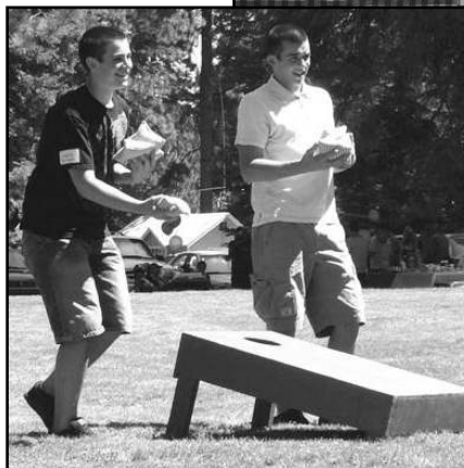
From the delicious buffet choices, above, to the bean bag toss, left, parishioners enjoy our 2009 annual picnic.